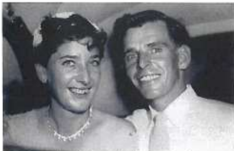
20th December 1956 married in Darwin after a three-day engagement.

Submissions: Do you have a story or photo you would like to share? Please call us on 4055 6440 or email us at admin@mcnc.org.au .