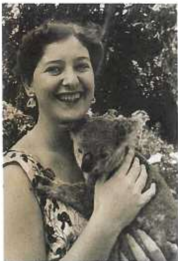
Koala Sanctuary Brisbane, 1952.

We returned to Brisbane in 1995, moved to a retirement village in Noosaville in 2011 and celebrate the adventures of the family.